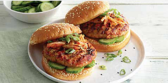
KOREAN KIMCHI TURKEY BURGER Pan-seared turkey burger is glazed with sweet Korean BBQ sauce, topped with spicy kimchi, sliced green onions, thinly sliced cucumbers and a sprinkle of black and white sesame seeds. Served on a toasted sesame seed bun with mayonnaise.