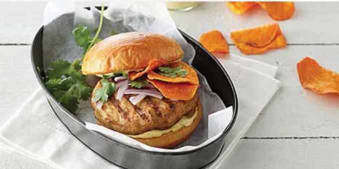
PERUVIAN TURKEY CRUNCH BURGER Juicy turkey burger is deep fried until crisp and placed on a toasted brioche bun. Garnished with red onions, cilantro, sweet potato chips and a zesty chile-lime mayo.