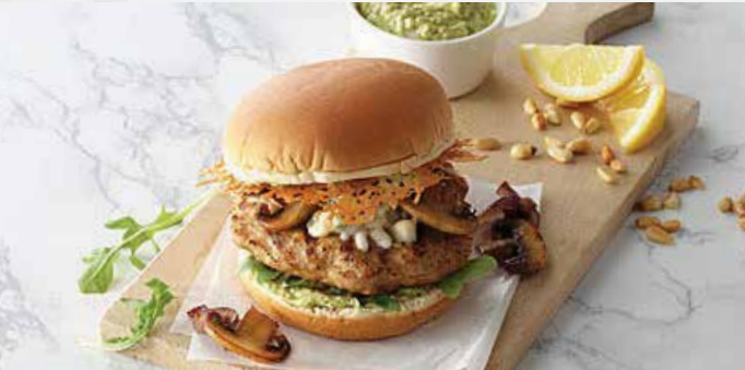
QUATTRO FORMAGGI TURKEY BURGER Charbroiled turkey burger is placed over a bed of baby arugula and topped with a blend of melted mozzarella and Gorgonzola cheese, grilled red onions, sautéed mushrooms and a delicate Manchego crisp. Served on a tender soft white bun with a smear of parmesan pesto aioli.