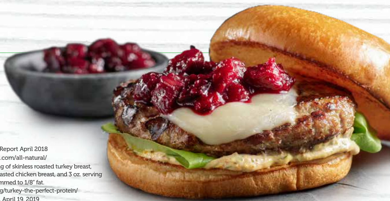
CHERRY RHUBARB TURKEY BURGER Featuring: JENNIE-O® All Natural* Burger Puck

For more recipes, or to learn more, visit jennieofoodservice.com