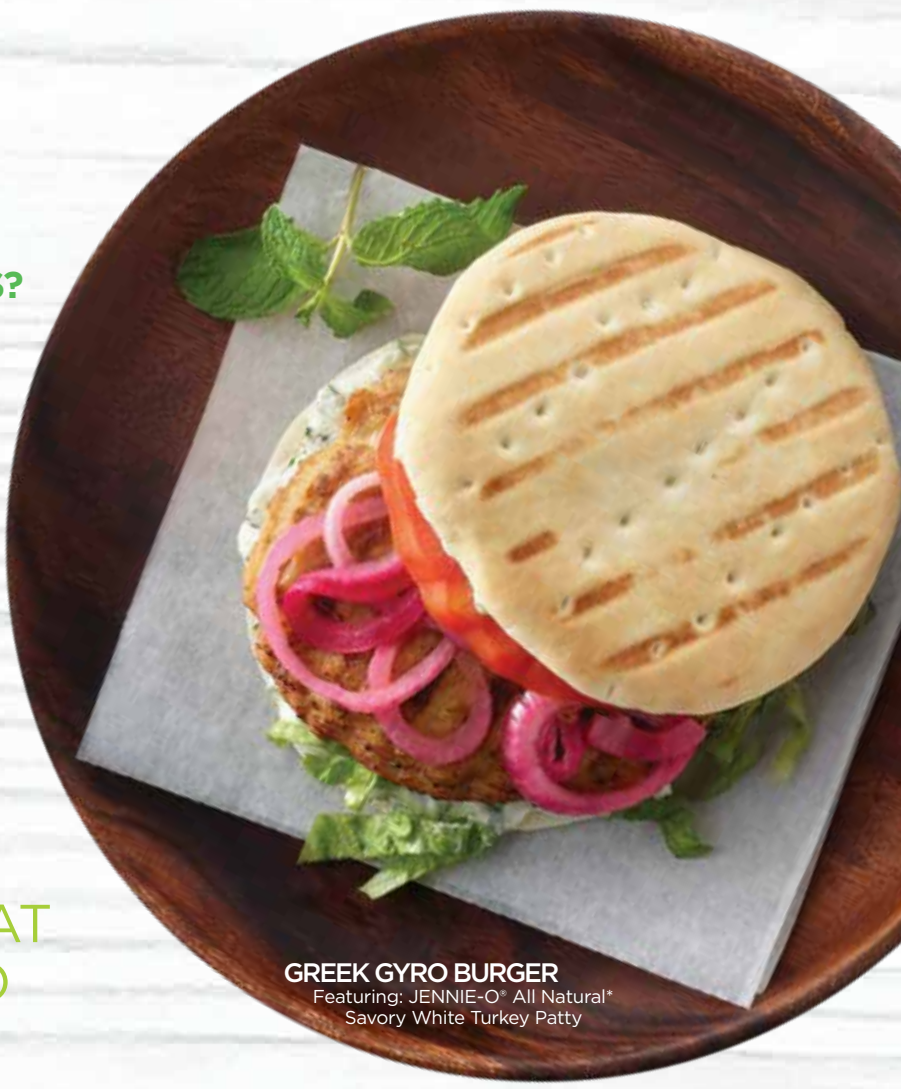
GREEK GYRO BURGER Featuring: JENNIE-O® All Natural* Savory White Turkey Patty

NEARLY 40% OF PEOPLE SAY THEY’RE EATING LESS RED MEAT TODAY COMPARED TO A YEAR AGO. 5