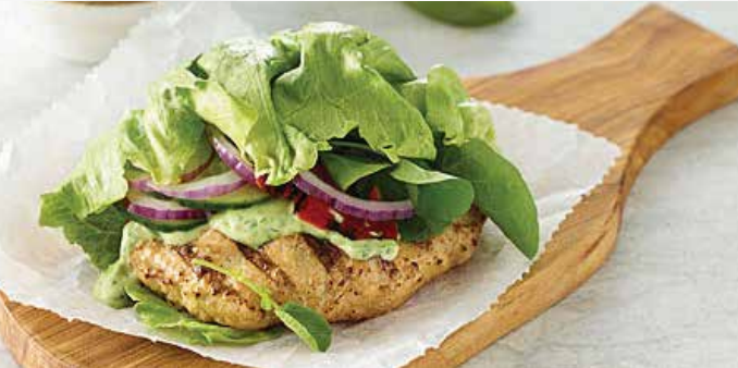
GARDEN BIRD Lean pan-seared turkey burger is loaded with cucumbers, fire-roasted red bell peppers, shaved red onions and creamy avocado and cilantro-dill aioli. Served in an iceberg lettuce wrap.