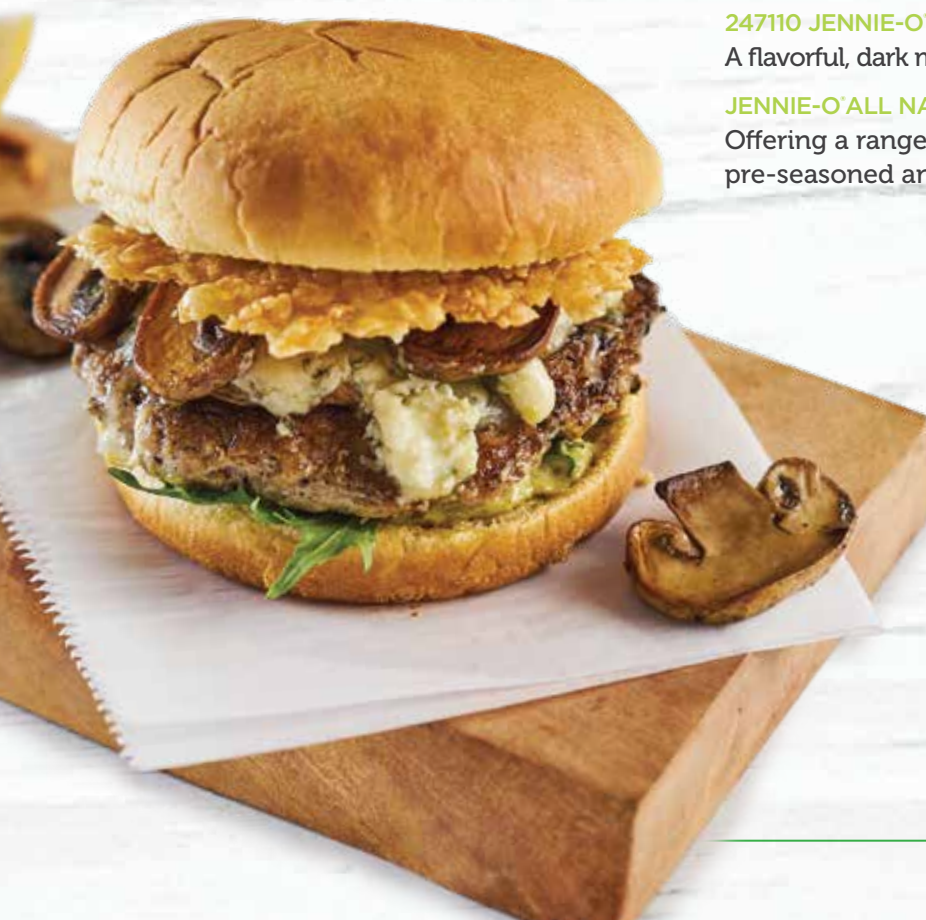
QUATTRO FORMAGGI TURKEY BURGER Featuring: JENNIE-O® All Natural* Burger Puck

247110 JENNIE-O® ALL NATURAL* BURGER PUCK, RAW A flavorful, dark meat turkey burger that’s ready to cook and serve.