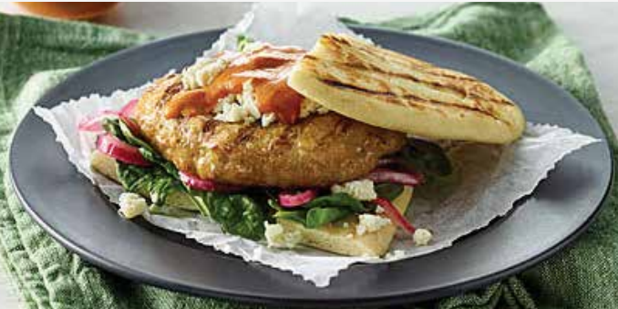
TIKKA TURKEY STACKER Savory turkey burger is fried and brushed with a rich and savory tikka masala sauce, then topped with fresh farmer's cheese, pickled red onions and fresh spinach. Wrapped in a freshly grilled naan flatbread.