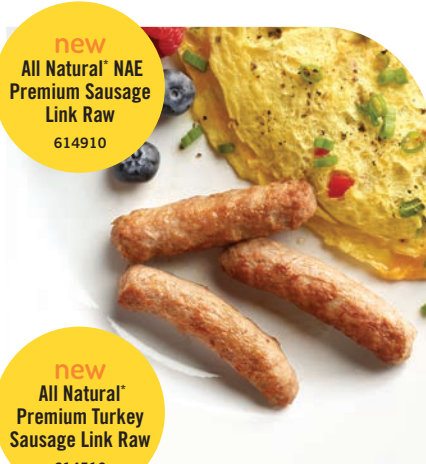
new All Natural® NAE Premium Sausage Link Raw 614910