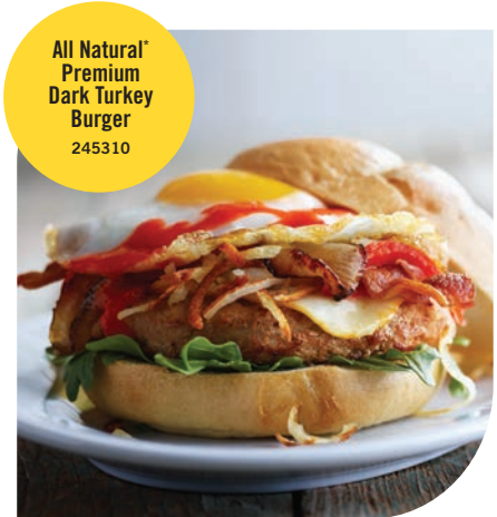
All Natural® Premium Dark Turkey Burger 245310